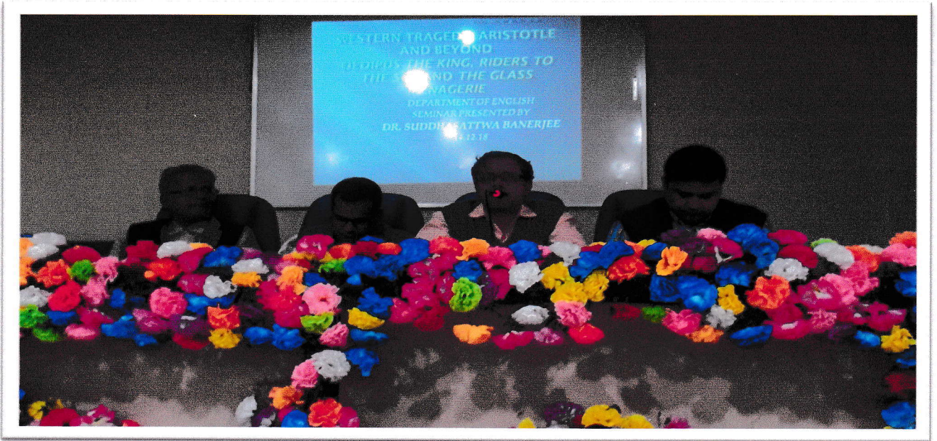
WELCOME NOTE & TIC'S ADDRESS