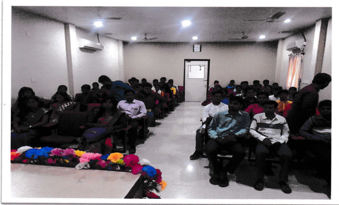
STUDENTS ATTENDING THE LECTURE